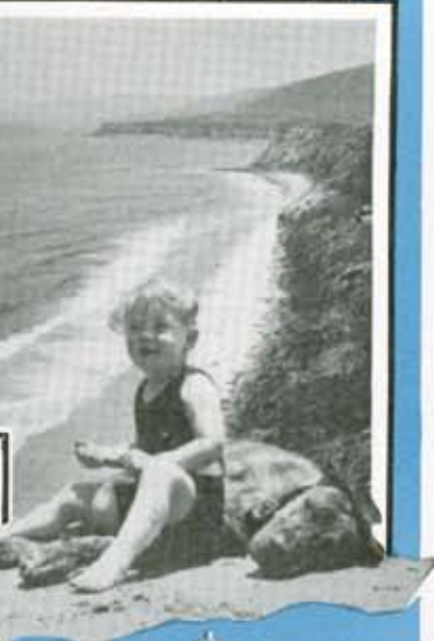
Clean Sandy Beaches